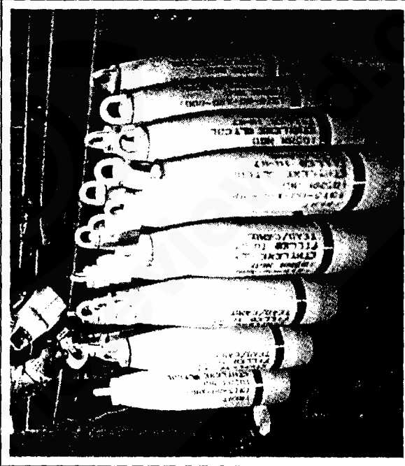
Gas-filled 105-mm shells at a Utah Army depot